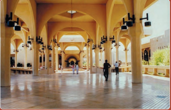
King Saud University

These institutes have three year programs for intermediate school graduates.