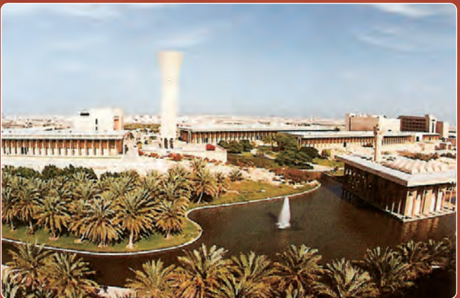
King Fahad University of Petroleum and Minerals

The announcement of the establishment of a women's university in Riyadh was the first step towards opening other women's universities in different parts of the country.