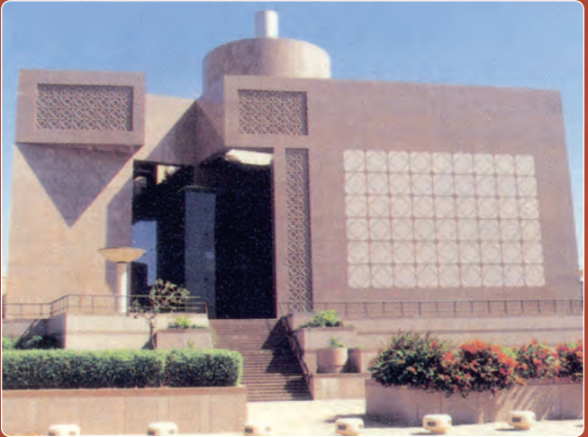
King Abdulaziz University Exhibition Hall

There has been a steady expansion of resources for disabled students as new institutions are founded in different geographic locations according to the needs of each province. Schools for the handicapped have increased from one school in 1960 to 27 schools in 1987, and most recently to 54. Presently there are 10 schools for the blind, 28 schools for the deaf and 16 schools for the mentally challenged.