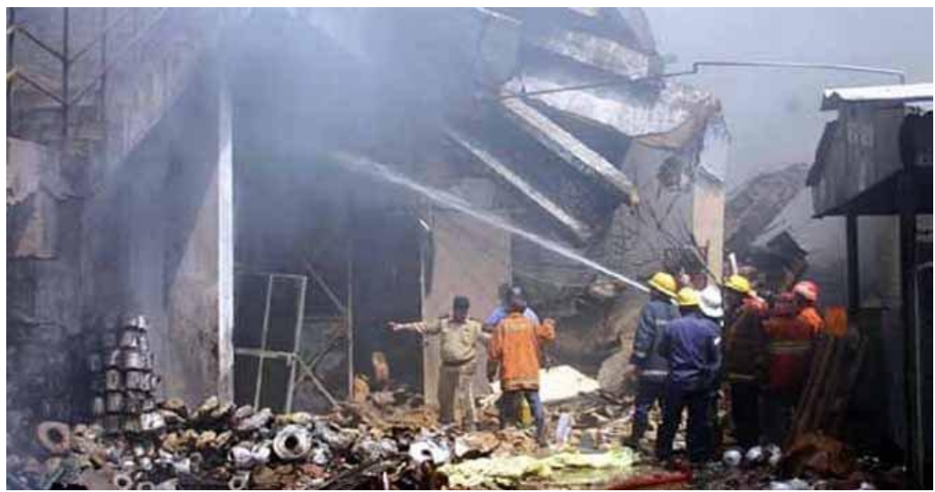
Firemen putting out a fire in a Karachi factory.

KARACHI: A fire that broke out in the chemical warehouse of a plastic bag manufacturing Factory in Karachi's gulbai area engulfed the entire factory on Sunday as the intensity of Blaze increased, DawnNews reported.