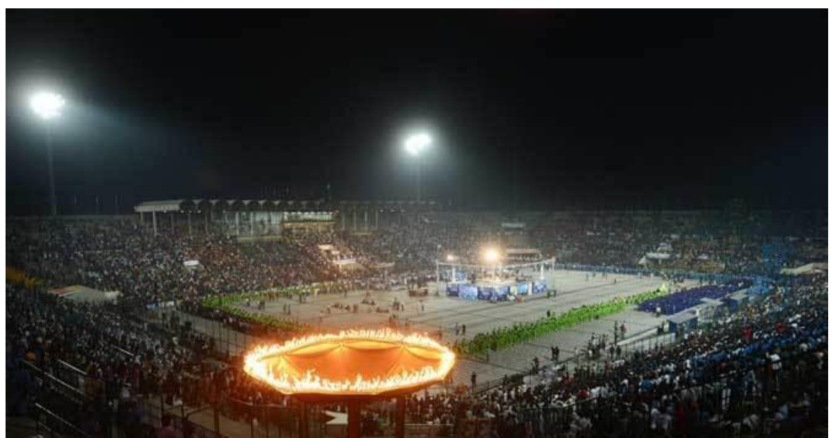
Pakistanis gather at the National Hockey Stadium for the new world record to sing the national anthem in Lahore on October 20, 2012.