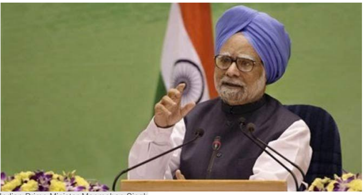
Indian Prime Minister Manmohan Singh

NEW DELHI: Three Indian ministers say they have resigned ahead of a Cabinet reshuffle by Prime Minister Manmohan Singh later this weekend.